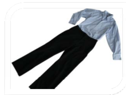
Classic striped dress shirt and navy slacks picked up at Savers/Value Village for just $20 (USD).

Men's styles will stay classic this year, and nothing beats a crisp pair of slacks and basic button down – both of which are thrift store abundances among top brand names. Classic preppy styles like striped shirts and pinstriped pants will keep guys looking dapper, and their wallet looking full.