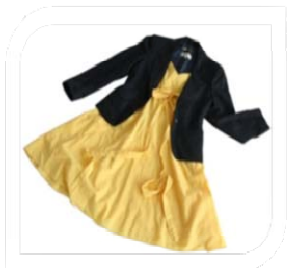
Bright yellow dress paired with a sleek black blazer, found for only $15 (USD)!