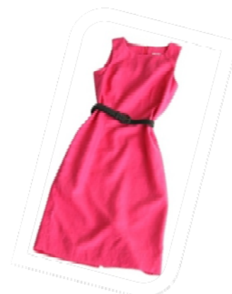
Magenta shift dress with braided belt, $13 (USD)

Pretty in Pink never looked this good. The 80s era of excess is back – with many of this season's trends highlighting the flashy fashions of the 80s. Look for bold brights with a modern twist, spotlighted in this chic, magenta shift dress. Cinch a belt around the waist for curvy cuteness, and you'll be sure to make a super statement.